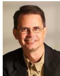
Chuck Owen Music